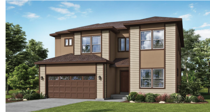
MOUNTAIN PRAIRIE elevation C