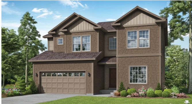
CAPE COD elevation A