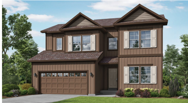
MODERN FARMHOUSE elevation B